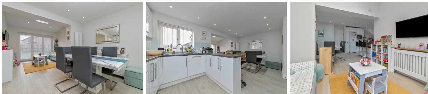
Ground Floor Approx. 583.7 sq. feet

A well presented semi detached family home built in 2018 located in a quiet private cul de sac serving just two properties. Upon entering the house there is a reception hall with coats cupboards for storage. The main hub of the house is an open plan kitchen, dining & living room. The kitchen is well appointed with soft closing cupboards and integrated appliances. Bi fold doors open onto the rear garden from the living area. There is also the benefit of a separate sitting room to the front of the property. There is also a utility room and cloakroom. On the first floor there are two double bedrooms one with an en suite shower room, a further single bedroom and family bathroom. Stairs then rise to the second floor where there is also a double bedroom with an en suite shower room ideal for teenagers or guests. Outside there are four parking spaces, side access to a rear garden that is laid to level lawn with a paved patio area. The garden has lighting surrounding the borders and the garden is fully enclosed. London Colney is situated on the outskirts of St Albans where the M25 is available at junction 22 and locally there is access to the M1 and A1M along with the A414 all connecting to the national motorway network. For the commuter there is a fast one stop train link to London Kings Cross and St Pancras International stations. EPC Rating 'B'. Council Tax Band 'E'.